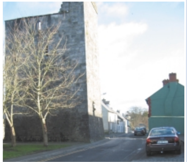
Historic building restricts access

If there are problems with trucks using an unsuitable area then the signing for truck routes and industrial estates should be