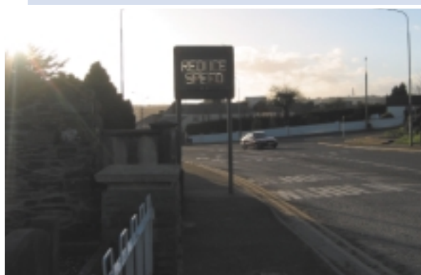
Fibre Optic warning sign

Weight restrictions are provided for in Article 17 of the Road Traffic (Traffic and Parking) Regulations, 1997 (SI No. 182 of 1997). These regulations specify that where the unladen weight of any vehicle exceeds the weight specified on the Regulatory Sign (RUS 015), then the vehicle shall not proceed beyond the sign. The only exception to such a restriction applies where it is necessary for a vehicle to enter a road solely for the purpose of gaining access to or from premises accessible only from that road. The Traffic Signs Manual indicates that weight restriction signs should be located on both sides of the road where the restriction commences and should face approaching traffic.