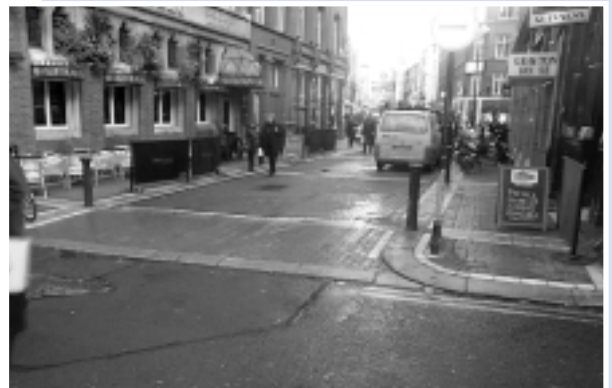
Pedestrian priority scheme