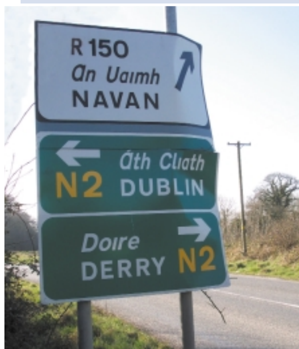
Signs damaged by HCV

In order to achieve effective management of commercial vehicles, the movement and parking of HCVs will need to be planned for and regulated. Licensing and planning controls can help to provide and regulate issues such as routing and overnight parking.