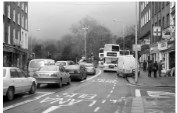
Service vehicle causing problems

Hazardous loads normally travel to/from regular locations such as manufacturing plants, warehouses and distribution terminals at ports or railheads. These regular trips lead to the identification of specific routes which can be agreed with the haulage contractors, emergency services, road authority, etc. so that appropriate responses to possible emergencies can be worked out and environmentally sensitive areas avoided.