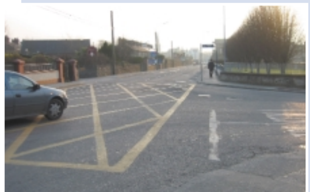
Wide junction designed for HGV causes problems for pedestrians