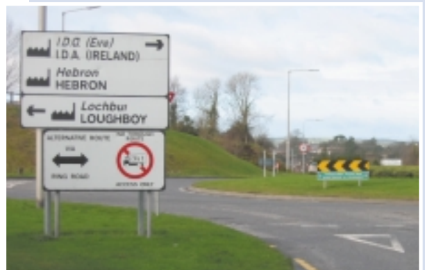
HGV route signing